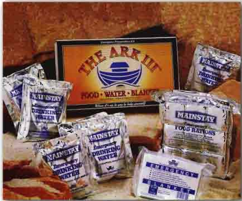
Size: 11" x 6" x 2-1/2" • Weight: 4 lbs.

3-Day Supply of Food & Water for 1 Person... Plus a Blanket!